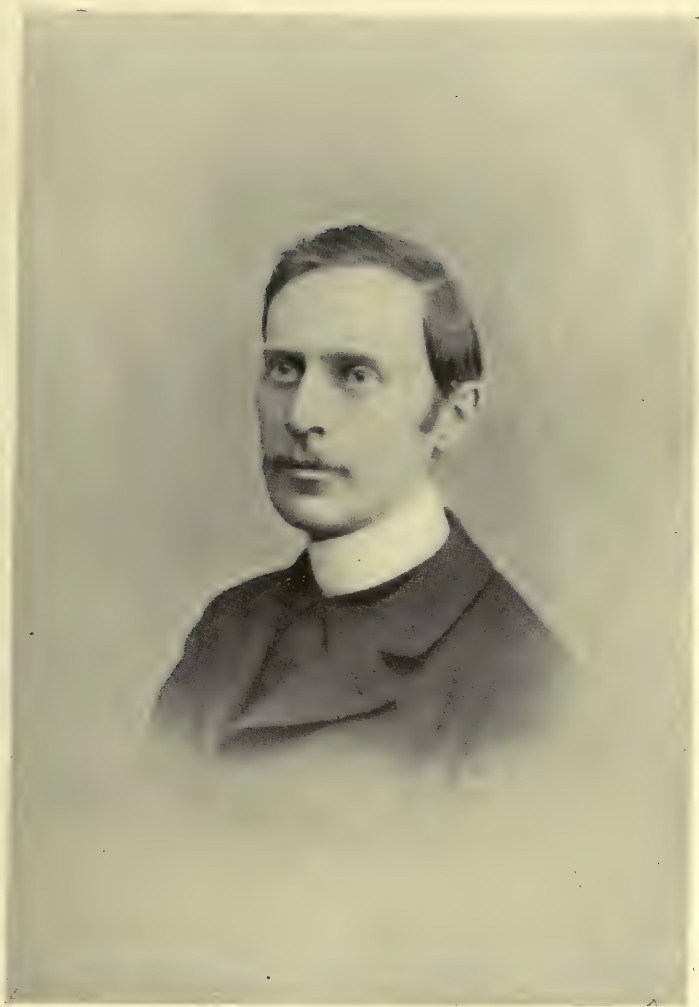
Romain Rolland at the time of writing Jean Christophe